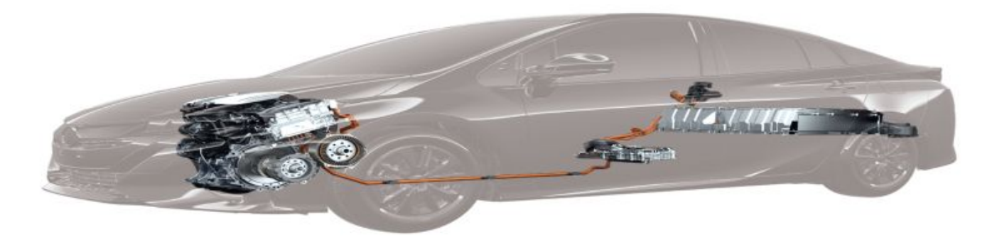
Figure 2. Skeletal example of how and where batteries are stored (Toyota 2016)

Nickel-metal Hydride; abbreviated to NiMH, is the most common types of batteries currently being