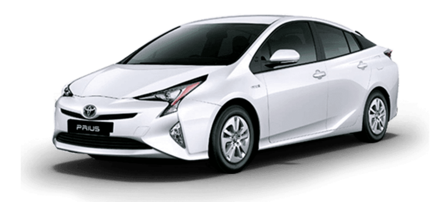
Figure 3. Toyota Prius.

Figure 4. The IC engine and the motor in the front, powering the batteries present in the backside.