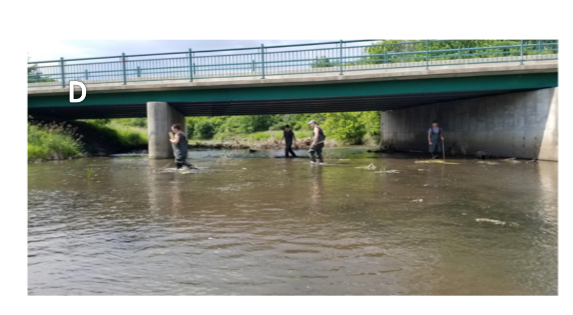
Figure 1. Lily Cache Creek at Van Horn Woods and Lily Cache Creek at Four Seasons Baseball Fields, Plainfield, IL. A. Van Horn Woods, established reach with no man-made structure (Top Left), B. Van Horn Woods, adjacent upstream reach with footbridge (Top Right). C. Four Seasons Baseball Fields, established reach with no man-made structure (Bottom Left), D. Four Seasons Baseball Fields, adjacent downstream reach with vehicle overpass (Bottom Right)