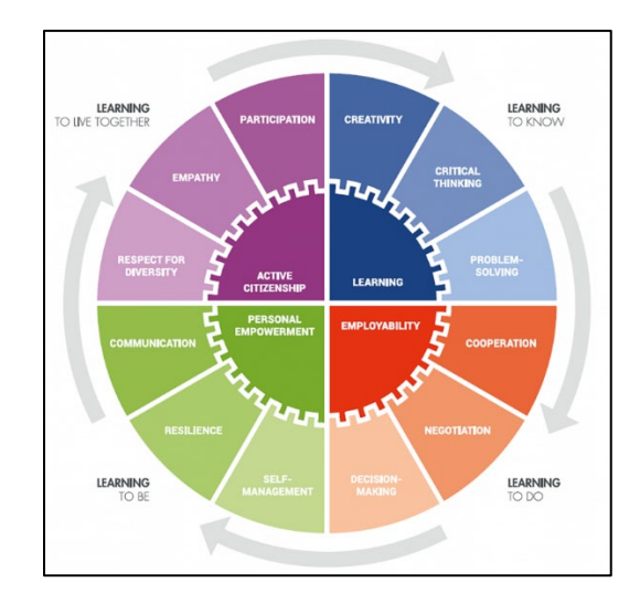
Figure 1. A uniform method of measuring the extent and depth of students' understanding of life skills in educational settings (UNICEF, 2019).

According to UNICEF (2019), to help young people thrive in education, the workforce, and throughout their own lives, they must acquire and practice a wide range of transferable skills known as life skills. They are made up of a set of competencies, including skills, attitudes, beliefs, habits, and domain-specific expertise. UNICEF and The World Bank have joined forces to create a uniform method of measuring the extent and depth of students' understanding of life skills in educational settings, to provide relevant data to policymakers and educators on how to best implement educational initiatives to foster important life skills. The approach is as follows: