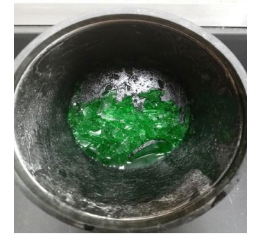
Figure 2. Green bottle glass cullet after polishing in rock tumbler.

rock tumbler and polishing media (Central Machinery Tumbler Media Ceramic Polishing Abrasive). After polishing, the cullet was rinsed, separated by size using an automated sieve with a range of 0.079 inches to 2.5 inches (Gilson USA Standard), as seen in Figure 2.