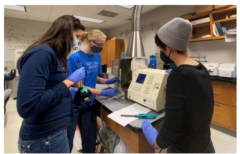
Figure 1. Students running calibration samples on the FAAS.

A calibration curve was created for the Flame Atomic Absorption Spectrometer (Buck Scientific 210VGP) using concentrations of 1, 5, 10, 15, 20, and 25 ppm (Figure 1). These solutions were generated from a 1000 ppm stock of chromium (CENCO Central Scientific Company, USA) with 2% (v/v) HNO<sub>3</sub>.