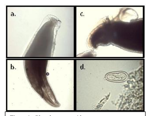
Figure 1: Physaloptera turgida

All 3 raccoons were infected with parasites. B. procyonis was found in the small intestine lumen of raccoons 1 and 3 and the large intestine lumen of raccoon 1. No attachment lesions were found on the intestinal mucosa. Male and female nematodes of B. procyonis were found in both raccoons with this parasite. Approximately 12 damaged proglottids from a tapeworm were found in the intestine of raccoon 2, but definitive identification of the species was not possible. A total of 7 parasites were found in raccoon 1, 1 parasite in raccoon 2, and 31 parasites in raccoon 3 (Table 1). Photographs of the anterior end and the posterior ends of male and female B. procyonis and eggs removed from a female specimen are seen in Figure 3.