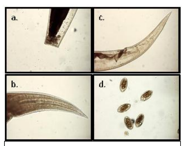
Figure 2: Cruzia americana

a. Anterior end [200X]; b. Posterior end (female) [200X]; c. Posterior end (male) [200X]; d. Eggs [400X]