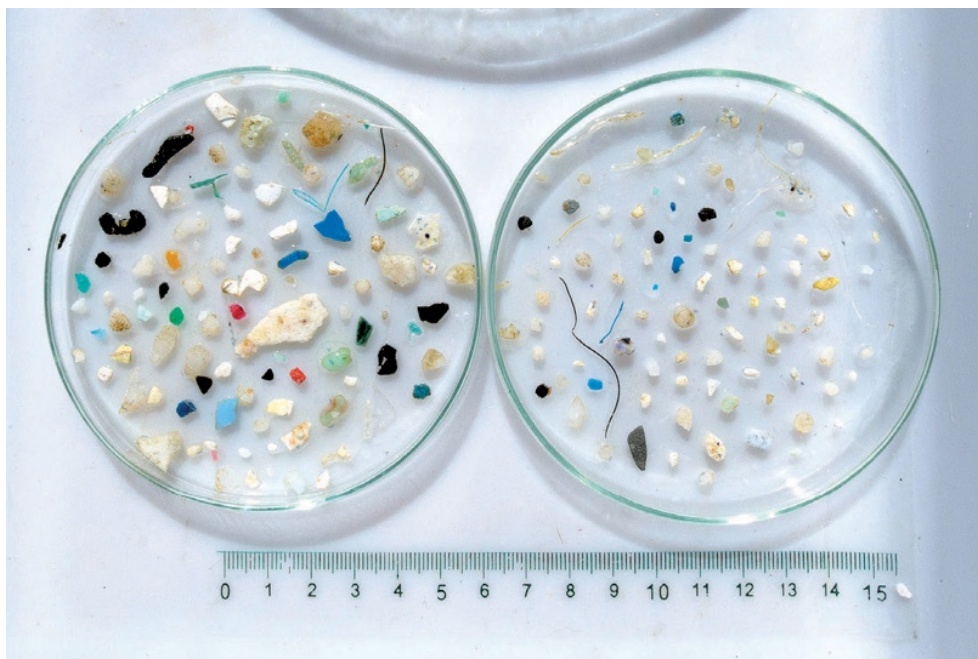
Figure 1: Microplastic sediments recovered from the Pacific Ocean.

Microplastics can be dangerous in a few different ways. The two general methods of danger are physical and chemical. The chemical dangers of microplastics can be shown when looking at the process of plastic creation/synthesis 1,24 . At its core, plastics are just polymers, made up of thousands of carbon chains with other atoms; usually, oxygen, hydrogen, nitrogen, or sulfur, added to them. Each carbon unit (a carbon atom with bonds to other atoms) is known as a monomer, and the whole chain is the polymer. While each type of plastic has unique requirements for synthesis, the underlying process is the same throughout. The first precursor is refined from a crude hydrocarbon, further purified into the desired monomer, and then polymerized to form the final product. The type of plastic is determined by looking at the functional group's name after the poly-prefix, hence the names such as polyethylene, polycarbonate, polyamide.