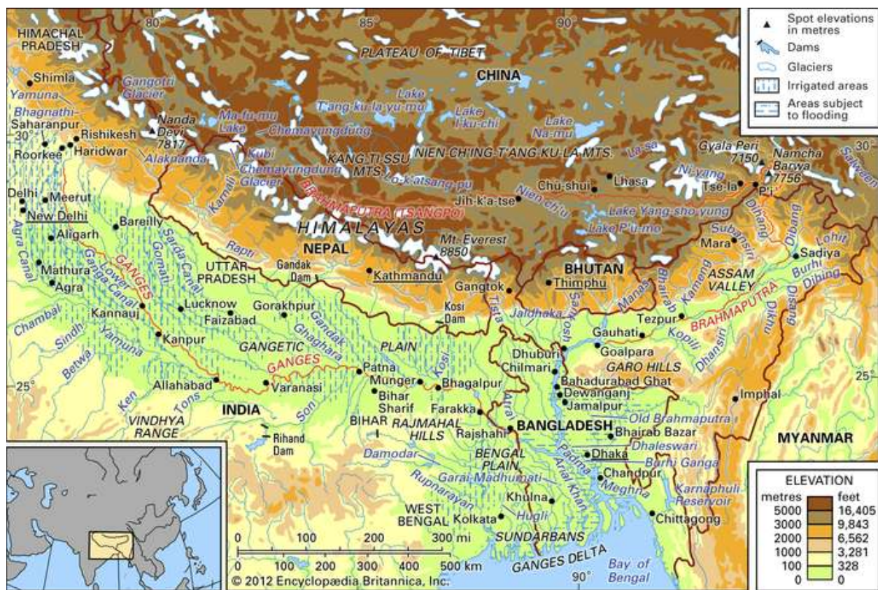
Figure 3 Map of the Ganges River and delta. All credit to Encyclopedia Britannica

The entry into the water supply and effects on the food web: