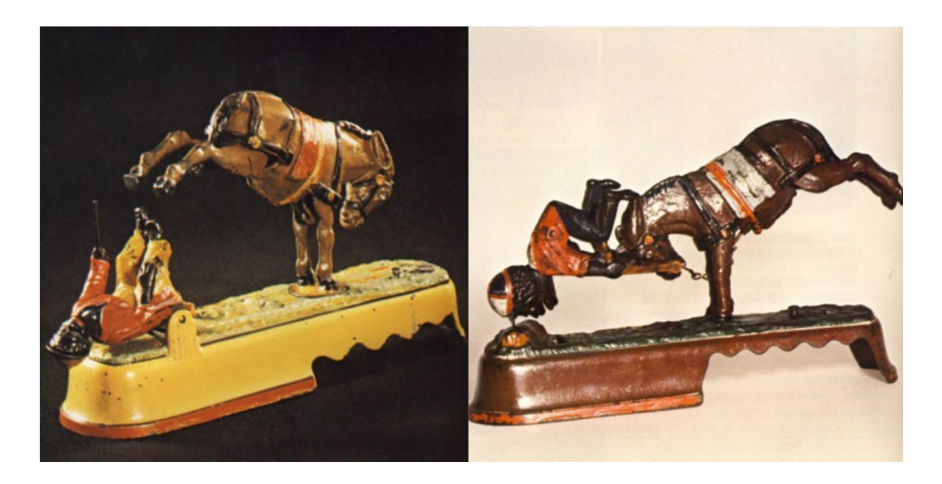
Figure 2. Mechanical Banks known as "Always Did Spised a Mule" that depicts a black man being kicked over by a mule (left) and bucked off a mule (right) (Norman, 1982).

On one mechanical bank, for example, a man sits atop a mule. His skin is pitch black, reminiscent of the minstrel shows that abounded in the early twentieth century. When the play feature was activated, the mule would swing forward, throwing the black man off its back (Norman, 1982). Another mechanical bank similarly depicts a black man comically falling over after being kicked by the hind legs of a mule (Norman, 1982). Only two of the countless banks that were produced, these examples nonetheless illustrate an all-too-common trope of the industry: racial or ethnic minorities finding themselves in undesirable, often dangerous, and purportedly humorous situations. Although many racial and ethnic groups were depicted in these toys, including Chinese and Irish people, African Americans were targeted the most often. Appealing to the same audiences as turn of the century minstrel shows, these interactive banks readily brokered in harmful, stereotypical depictions of nonwhite Americans and normalized the mistreatment of Black Americans.