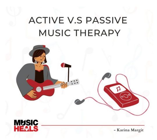
Figure 1. Direct Difference between Active MT and Passive MT.

Down Syndrome (DS) <sup>1</sup>, which is caused by the presence of an extra copy of human chromosome 21, is a genetic disorder that affects approximately 1 in every 700 births, making it the most common chromosomal disorder. DS is characterized by intellectual disability, physical growth delays, distinctive facial features, as well as difficulties in socialization (Desai, 1997; Malak et al., 2015). Children with DS often face challenges that impact their social skills and their ability to communicate effectively with others. Traditional therapeutic interventions for children with DS often focus on speech and language development, occupational therapy, and physical therapy (Davis, 2008; Ruiz-González et al., 2019). While these interventions are essential, they may not fully address the socialization needs of children with DS. Therefore, there is a need to explore alternative therapeutic approaches that can effectively promote socialization skills in this population. This paper will explore the use of active music therapy as a means of promoting socialization development in children under 12 with DS.