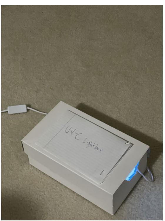
Figure 2. UV-C lightbox with the light and lid on