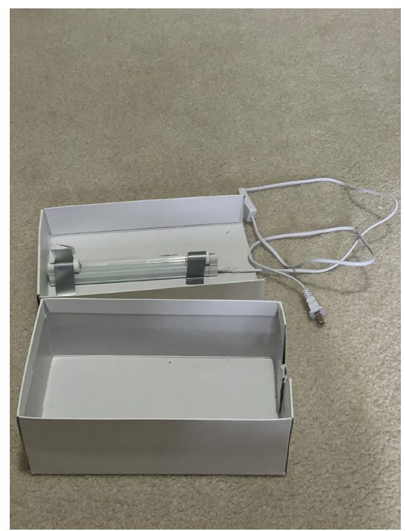
Figure 1. UV-C lightbox with the lid off

UV-C light can be highly damaging to the recipient if seen directly (Holton et al., 2017); therefore, proper precautions need to be held when setting up the experiment. A light apparatus was used to irradiate the plants or treat the plants with UV-C light (Figure 1). The device included a shoe box (or any opaque box with a detachable lid) with a hole cut into the side, a UV-C light rod (preferably one that can be operated using a switch), and tape. To create the contraption firmly attach the UV-C light rod to the lid of the box using tape. The box needs a hole so that the scientist conducting the experiment can tell if the UV-C light is on without looking directly at it. The UV-C light used in the experiment was pluggable and operated using a switch for efficiency, as shown in Figure 1. Furthermore, the box used in the experiment measured 28.6cm x 16.5cm x 10.9cm. The other crucial components of the experiment are the plants. The experiment used Begonias for multiple reasons, as discussed in 3.1. To obtain the most accurate results, identical plants, or plants of the same genus, are ideal. If the experiment will be conducted indoors, scientists should consider plants that do not need high amounts of sunlight because that would be difficult to accomplish and may affect the outcome of the experiment.