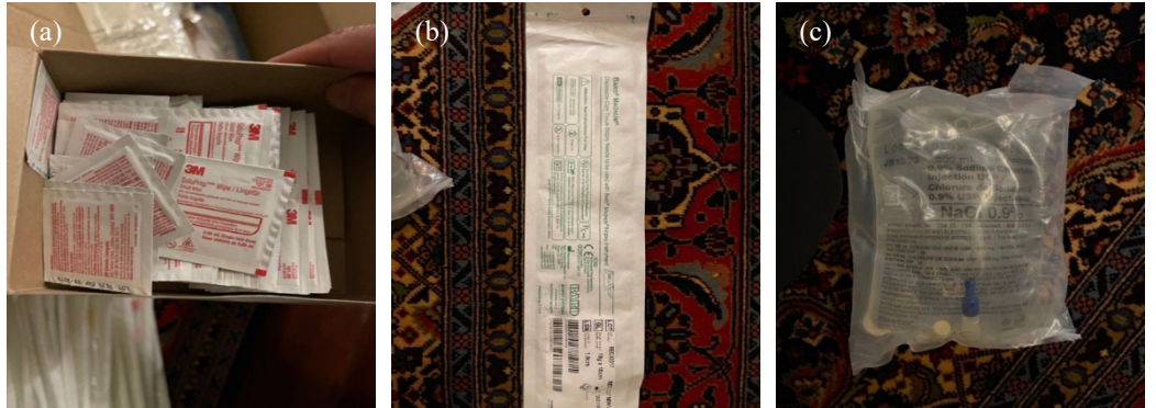
Figure 2. Examples of medical supplies that were redistributed to animal hospitals and clinics during the No Fog; Go Dog project in Vancouver, Canada. (a) Alcohol wipes, (b) Biopsy Needle, and (c) Ivy drip.

Another project that has been utilizing the redistribution method for reducing medical waste is the No Fog; Go Dog project by The Symbiotic People. The Symbiotic People is a group composed of high school students located in Vancouver, Canada that specifically targets hospitals and vet clinics("The Symbiotic People - No Fog; Go Dog!," 2020). The group also has interational members, including the author, who aids in communicating with organizations across the globe. Local organizations, Langley Hospital and Alpha Animal Hospital, were redistribution participants. Items that were given to the vet clinic were alcohol wipes, biopsy needles, and ivy drips (Figure 2). As a result, The Symbiotic People was able to reduce a dozen boxes of soon-to-be throw out medical products over the course of 6 months and redistribute them over to vet clinics("The Symbiotic People - No Fog; Go Dog!," 2020). Lastly, this group was able to make social impacts as well by opening social media accounts that included details of the project. This report that was published was viewed by numerous peers and adults as a source of inspiration and a way to raise awareness about the medical waste situation.