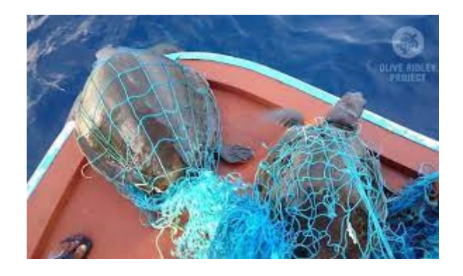
Figure 3- two Olive Ridley Turtles in the Maldives found trapped in ghost net fishing gear: (IUCN, 2015)

One driver of unsustainable fishing in the Maldives is the prevalence of ghost nets (See figure 3). Ghost nets are fishing nets that have been carelessly discarded after use. From 2015 to 2020, the Olive Ridley Project, a local Maldives-based NGO removed 1340 ghost nets from local shorelines (IPNLF, 2020). Ghost nets are destructive as they can trap marine species, large and small and render them immobile while trapped in the net. In 2021, the Olive Ridley project rescued four Olive Ridley turtles and two sharks from just one length of the net (Olive Ridley Project, 2021). Trapped organisms may die or face serious injury unless rescued, and this can have drastic effects on local reef ecosystems if there is a large number of organisms trapped or if the organism plays an especially important role in the functioning of the ecosystem. Ghost nets can also encapture coral polyps and destroy them, possibly leading to death.