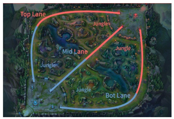
Figure 1. League of Legends game map

Each match takes place on a map called "Summoner's Rift." During the game, players occupy these physical locations as shown in Figure 1. The two teams are referred to by color. The team whose base is located in the bottom left corner of Figure 1 is referred to as the "blue" team, while the team whose base is located in the top right of the corner is referred to as the "red" team.