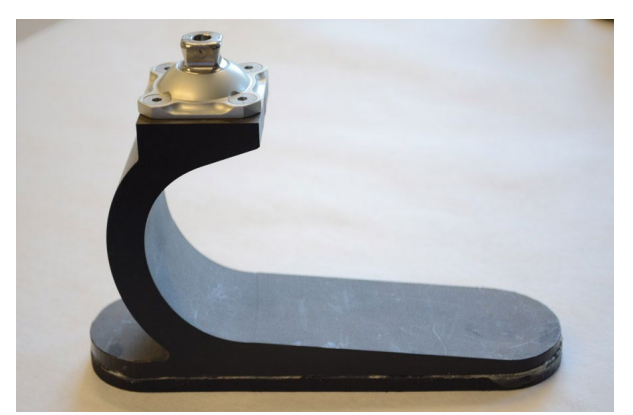
Figure 3. A low-cost alternative to a prosthetic foot

Sockets have been a limiting factor in prosthetic construction. Sockets provide the interface between the residual limb and the prosthetic. Sockets require casting, molding, and multiple fitting sessions which makes them expensive in time and finance. In addition, any changes in limb growth, weight gain or loss, limb maturation, etc. would cause the socket to no longer fit and a new one would be needed. A socket often requires frequent follow-ups which is an added difficulty as many amputees have to travel far distances for prosthetic care. The socketless holder