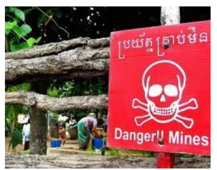
Figure 4. A landmine sign in Cambodia

that cause people to become amputees. By preventing these casualties' fewer people would become amputees, and fewer people would require prosthetics in underdeveloped countries.