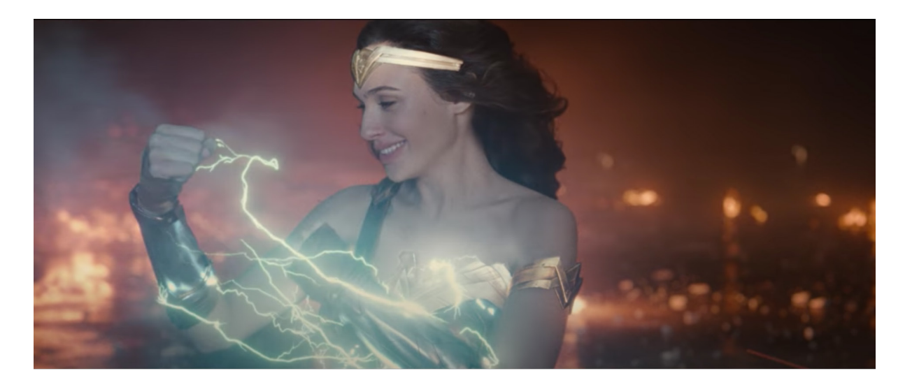
Fig. 2. Diana smiles during the final battle. (Warner Bros. Pictures, 2017. Author's screenshot).

Demonstrating both masculine and feminine approaches to warfare and by gaining victory through both brute strength and the power of love, Diana's hybridity is closely related to her status as a warrior. Penthesilea's hybridity, on the other hand, is more nuanced. Tenderness is rarely attributed to her. Her femininity is explicit only in passing comparisons of her as a bringer of peace, light, and joy, yet these too are closely tied to her masculine prowess as a warrior. Instead of attributing her femininity to internal qualities that define her character, Smyrnaeus emphasizes Penthesilea's femininity in her interactions with Achilles, her male counterpart. Her hybridity only manifests in her defeat by his hypermasculine form. Thus, this dynamic will be discussed further in the second half of this analysis along with the consequences of Diana's and Penthesilea's hybridity.