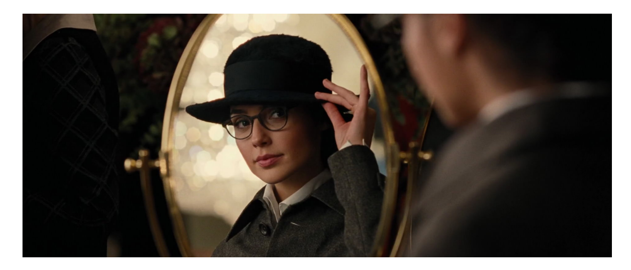
Fig. 4. Diana looks in the mirror with glasses. (Warner Bros. Pictures, 2017. Screenshot from Movie-Screencaps.com).