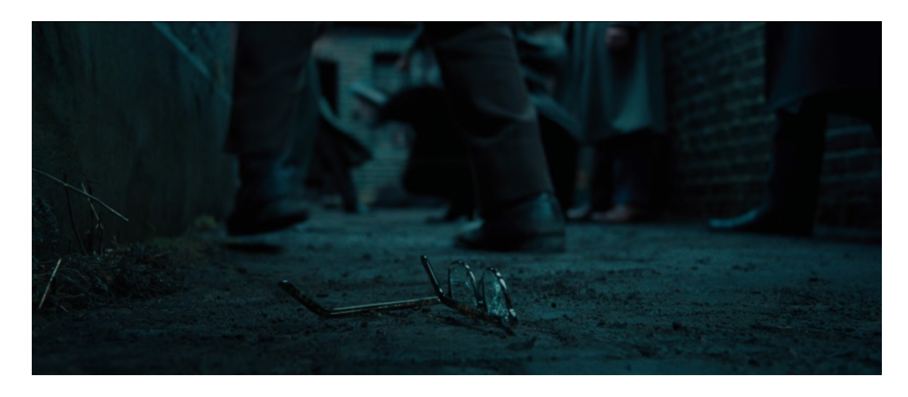
Fig. 5. Diana's glasses are broken during a fight.