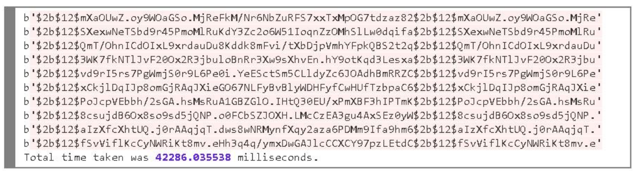
Figure 15. Output of the python script in Figure 3 when run against the password JeffPurpleCats76!.