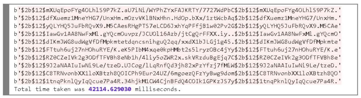
Figure 10. Output of the python script in Figure 3 when run against the password Jeff123.

'07008d4ceca9fcf36c8022bf74dba9b81795a5fb5c5874d8080ebc426a095680' '07008d4ceca9fcf36c8022bf74dba9b81795a5fb5c5874d8080ebc426a095680' '07008d4ceca9fcf36c8022bf74dba9b81795a5fb5c5874d8080ebc426a095680' '07008d4ceca9fcf36c8022bf74dba9b81795a5fb5c5874d8080ebc426a095680' '07008d4ceca9fcf36c8022bf74dba9b81795a5fb5c5874d8080ebc426a095680' '07008d4ceca9fcf36c8022bf74dba9b81795a5fb5c5874d8080ebc426a095680' '07008d4ceca9fcf36c8022bf74dba9b81795a5fb5c5874d8080ebc426a095680' '07008d4ceca9fcf36c8022bf74dba9b81795a5fb5c5874d8080ebc426a095680' '07008d4ceca9fcf36c8022bf74dba9b81795a5fb5c5874d8080ebc426a095680' '07008d4ceca9fcf36c8022bf74dba9b81795a5fb5c5874d8080ebc426a095680' '07008d4ceca9fcf36c8022bf74dba9b81795a5fb5c5874d8080ebc426a095680' '07008d4ceca9fcf36c8022bf74dba9b81795a5fb5c5874d8080ebc426a095680' '07008d4ceca9fcf36c8022bf74dba9b81795a5fb5c5874d8080ebc426a095680' '07008d4ceca9fcf36c8022bf74dba9b81795a5fb5c5874d8080ebc426a095680' '07008d4ceca9fcf36c8022bf74dba9b81795a5fb5c5874d8080ebc426a095680' '07008d4ceca9fcf36c8022bf74dba9b81795a5fb5c5874d8080ebc426a095680' '07008d4ceca9fcf36c8022bf74dba9b81795a5fb5c5874d8080ebc426a095680' '07008d4ceca9fcf36c8022bf74dba9b81795a5fb5c5874d8080ebc426a095680' '07008d4ceca9fcf36c8022bf74dba9b81795a5fb5c5874d8080ebc426a095680' '07008d4ceca9fcf36c8022bf74dba9b81795a5fb5c5874d8080ebc426a095680' '07008d4ceca9fcf36c8022bf74dba9b81795a5fb5c5874d8080ebc426a095680' '0701time taken was 11.000156 milliseconds.