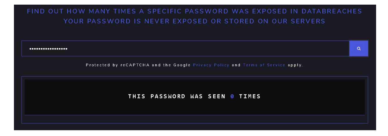
Figure 1. Checking whether the password Jeff123 has been exposed in a data breach via BreachDirectory (Patra, n.d.).