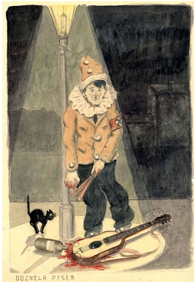
Fig. 3 Pavel Fantl, The Song is Over , 1944. Watercolor and Indian ink on paper, 30.2 x 22.5 cm. Jerusalem: Collection of the Yad Vashem Art Museum. © Ida Fantlová.

he portrayed Adolf Hitler as a bloody, drunken street clown, surrounded by bottles of booze, a broken string instrument, and a black animal (see Fig. 3).