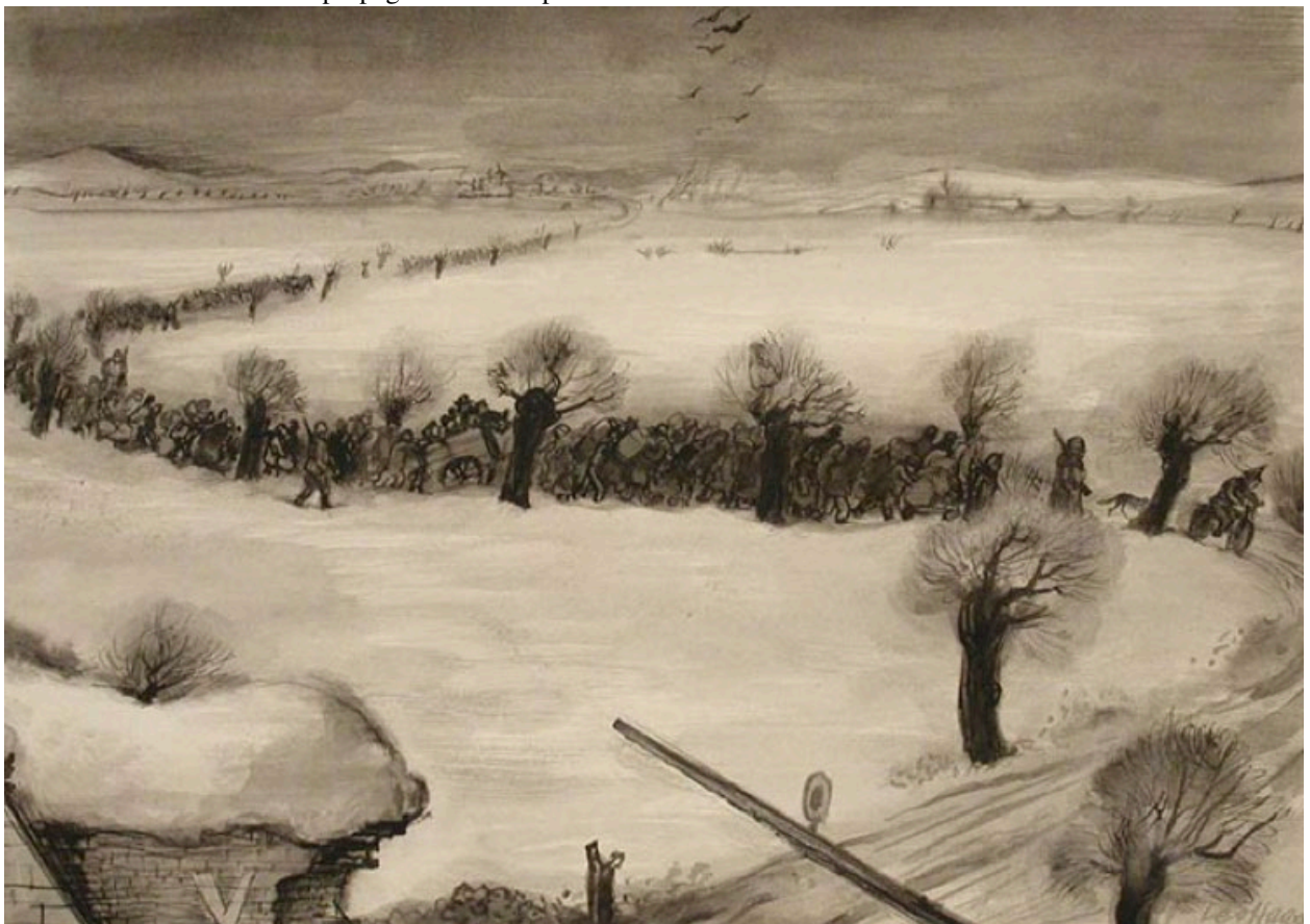
Fig. 1 Leo Haas, Transport Arrival , 1942. Indian ink on paper, 37.7 x 49.2 cm. Jerusalem: Collection of the Yad Vashem Art Museum.

A perfect example of one such piece is Transport Arrival (see Fig. 1). At first glance, Transport Arrival may have looked like hundreds of other propaganda landscapes that Haas was forced to create.