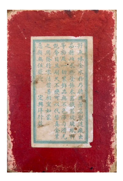
Figure 1 Gold paint box from Wang Hing factory

The table below (See Table 1), from the Thirteen Factories Museum in Guangzhou, shows a conversation between a Cantonese merchant and a western trader. Although the Cantonese merchants spoke English, they used the Cantonese syntax to construct their sentences, and the westerners tried to respond with a Cantonese accent, reflecting the sentence structure used by the merchants. The language they spoke, which was a unique register developed between the Cantonese and foreigner traders, has obvious traits of both English and Cantonese.