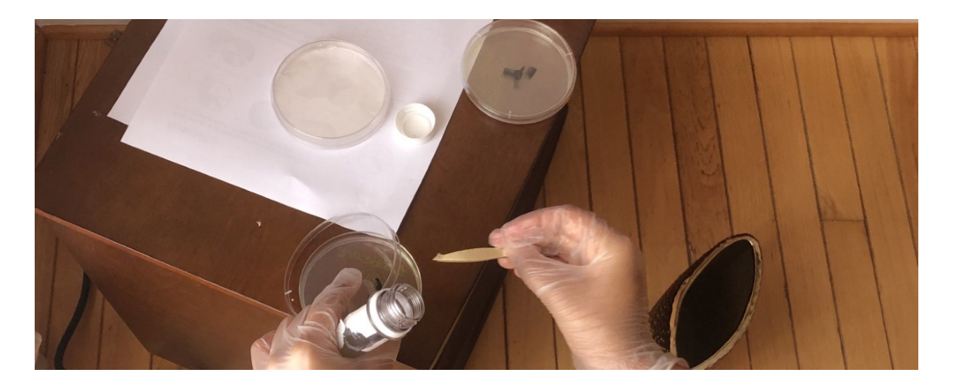
Figure 3. The eyelash extensions are being removed from the test tube to the plate using a tweezer. The hinge-method is being utilized to open the plate to minimize contamination via column of vertical air.

The eyelash extensions were directly taken from the nutrient broth with bacteria into the clean nutrient agar plates. The bacteria that the eyelash extensions had trapped during the time in the test tubes were transferred with the eyelash extensions, and the presence of the bacteria was proved with the growth of the colonies coming from the eyelash extensions. The following data table and pictures reveal the number of colonies recorded on each plate after 72 hours of growth at 75°F.