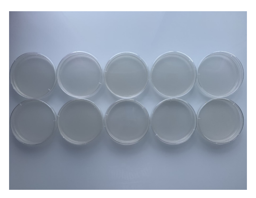
Figure 1. Nutrient agar in petri dishes

The sable eyelash extensions arrived after the mink and silk extensions, but the same procedure was used to test all three eyelash extensions for bacterial growth. Prior to the start of the experiment, the contents of the nutrient agar bottle were melted and poured into petri dishes. Nutrient agar is a solid medium that can support a plethora of bacterium to grow due to its high concentration of nutrients. <sup>2</sup> The petri dishes were stored in the fridge until the agar within was solidified and ready for bacterial cultivation.