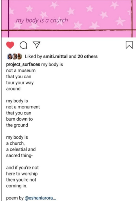
Figure 2. Screenshots of Online Resource Bank from Instagram Page of 'Project Surfaces'