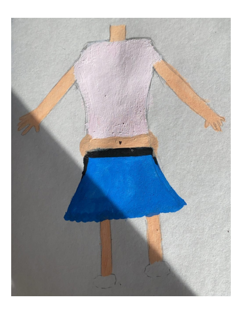
Figure 6. 'Self-Portrait' of Powerpuff Girl

What is striking about the 'self-portrait' of Powerpuff Girl is the noticeable absence of a face — the quintessence of a person. Her explanation of her 'self-portrait', with a focus on her outfit, makes her come across as a mannequin, rather than a human: "There's no real abstract thing to it, it is just how I see myself in the mirror. That outfit is one of my favorites and I just feel confident in it." As with Blue Bunny, she also asserted that her depiction had "no particular emotion behind it." However, her claim that this faceless image resembled her reflection in the mirror thought of as "me, myself, and I" showed a high degree of estrangement of her body image from her true feelings.