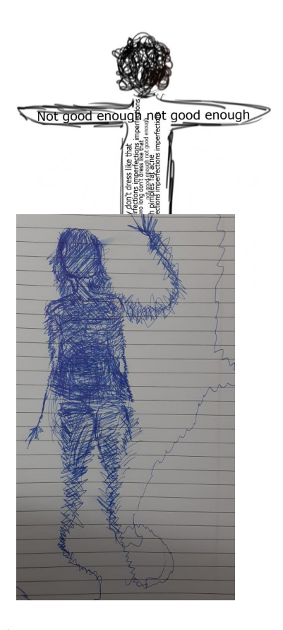
Figure 4. 'Self-Portrait' of Pink Panther

July's description of her initial body-image in the form of the things people said about her: "...because I'm short... people just keep talking about the same things... People just call you names at school and it just [gets] to you."