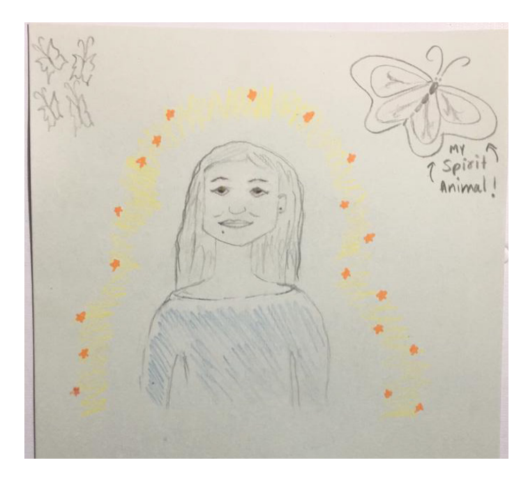
Figure 8. 'Self-Portrait' of Sudoku

"I never take out the time to think about myself, my body, and the way I look. So doing that while knowing that no one would judge me felt very nice... I kind of discovered how I think of myself, because while drawing, I couldn't think of anything negative being a representative of me."