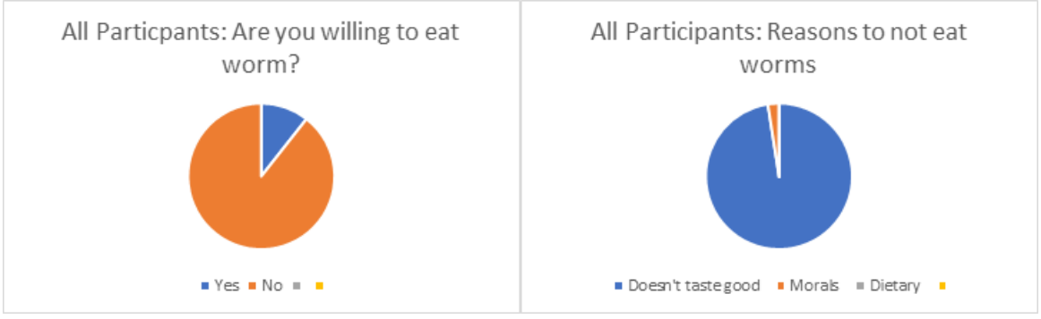
Figures 10 and 11: Pie charts displaying all participants' willingness to eat worms and the reasons why

The last animal that was evaluated was worms. These results contrasted extensively from the other animals by showing data of relative uniformity among all participants in the survey. As can be seen in Figures 10 and 11, 89.40% of all participants chose that they were unwilling to try worms. In comparison to rabbits and squirrels in which survey partakers would at least try the new variety of food if given the option, almost everyone who took the survey, no matter whether they were a member of the FFA, were unwilling to taste worms. This can assumedly be a result of the negative palatable connotation, with the perception of worms having a peculiar texture and contaminated underground habitat.