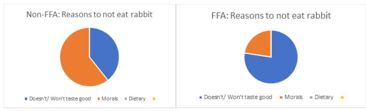
Figures 4 & 5: Pie charts displaying non-FFA and FFA member's reasons to not eat rabbit

These results can also be seen with squirrels, an animal that is like rabbits in its appearance and overall connotation. The results are different in the willingness to eat the animals but are parallel in the reason to not eat squirrels, as compared to the rabbit pie charts. As seen in Figures 6 and 7, 25.81% of non-FFA members are willing to eat squirrel compared to 51.81% of FFA members. This is a large discrepancy among the likelihood to eat squirrel compared to rabbits, with a higher amount of people choosing to not eat squirrel. This distinction can be inferred as a different assumption in the safety of eating squirrel. Even with a disclaimer stating that the animals would be safe to eat, squirrels are usually associated with diseases, which can be inferred as to why fewer respondents were willing to eat them. FFA members stayed mostly consistent with their results, decreasing by only 12% compared to rabbits. They are probably more likely to eat squirrel because they understand the meat industry. They gain knowledge of raising outdoor livestock and eventually processing them for consumption, which allows them to understand the process of making meat safe for consumption more in depth as compared to a non-FFA individual.