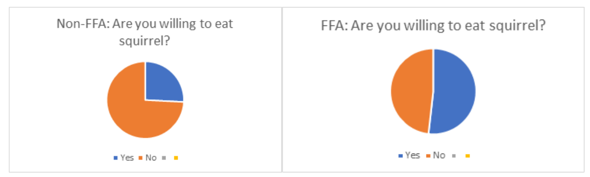
Figures 6 & 7: Pie charts displaying non-FFA and FFA member's willingness to eat squirrel

learning to not grow emotional attachments to animals as they will end up eventually selling them, the diminished excitement of being exposed to animals over a long period, or just their curriculum. Either way, the FFA has a prominent association of members becoming less attached to an animal of any species, no matter their prolonged time spent with animals.