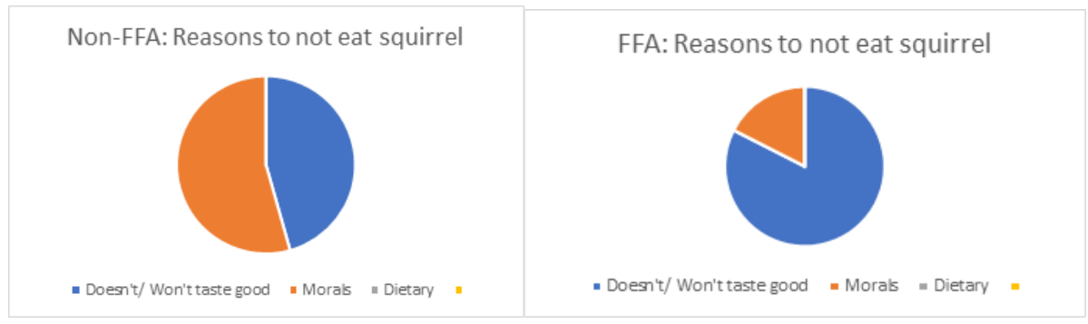
Figures 8 & 9: Pie charts displaying non-FFA and FFA member's reasons to not eat squirrel

The last animal that was evaluated was worms. These results contrasted extensively from the other animals by showing data of relative uniformity among all participants in the survey. As can be seen in Figures 10 and 11, 89.40% of all participants chose that they were unwilling to try worms. In comparison to rabbits and squirrels in which survey partakers would at least try the new variety of food if given the option, almost everyone who took the survey, no matter whether they were a member of the FFA, were unwilling to taste worms. This can assumedly be a result of the negative palatable connotation, with the perception of worms having a peculiar texture and contaminated underground habitat.