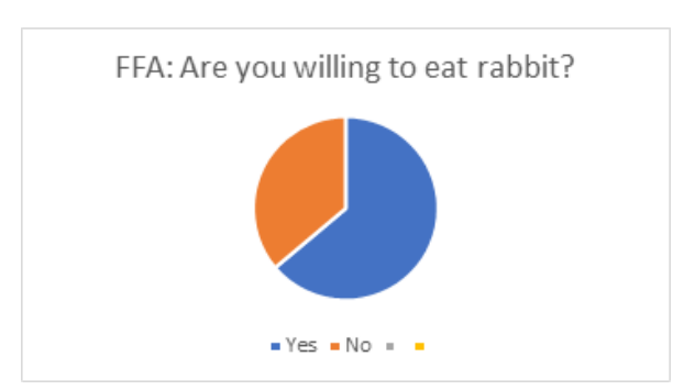
Figures 2 & 3: Pie charts displaying non-FFA and FFA member's willingness to eat rabbit